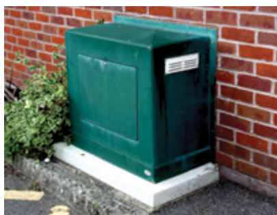
Example of floor standing kiosk

Meter kiosks for larger sized meters are shown left. Larger meters are used for commercial and industrial properties, for example restaurants, factories, energy centres, hospitals etc. They may also be used for larger domestic properties or properties with a swimming pool. These GRP kiosks come in a variety of shapes and sizes depending on the meter required. A list of kiosk sizes can be found on the next page.