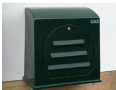
Example of wall mounted kiosk